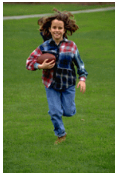
One of the Best Camps around!

We will also have guest speakers from a variety of career fields join us to talk with our campers about their professions every week.